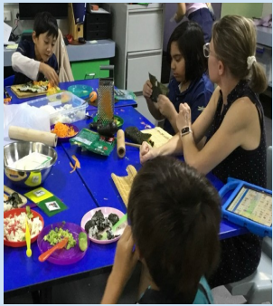
Group Cooking, LA 3/4 make sushi.

Our cooking lessons continue to be a highlight. So far, we have made dumplings, pizza, brownies and cakes. These lessons give students the chance to look at, touch, smell and taste different foods while naturally building numeracy and literacy skills. They practice counting, measuring, reading and following recipe steps. Cooking also helps strengthen fine motor skills through cutting, mixing, rolling, spreading and wrapping. An impressive start to the year.