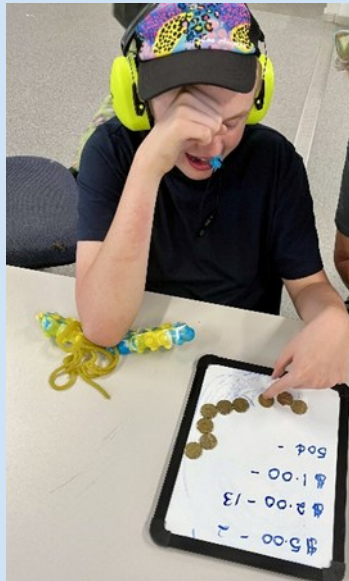
We enjoy counting the money from canteen orders.