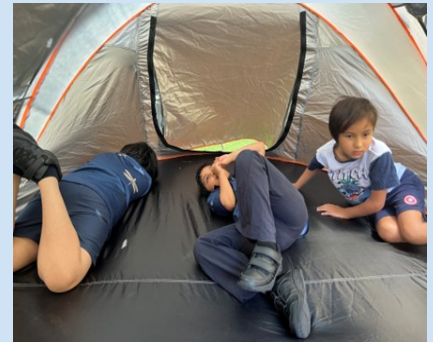
Hanging out in the tent with our friends can be relaxing.